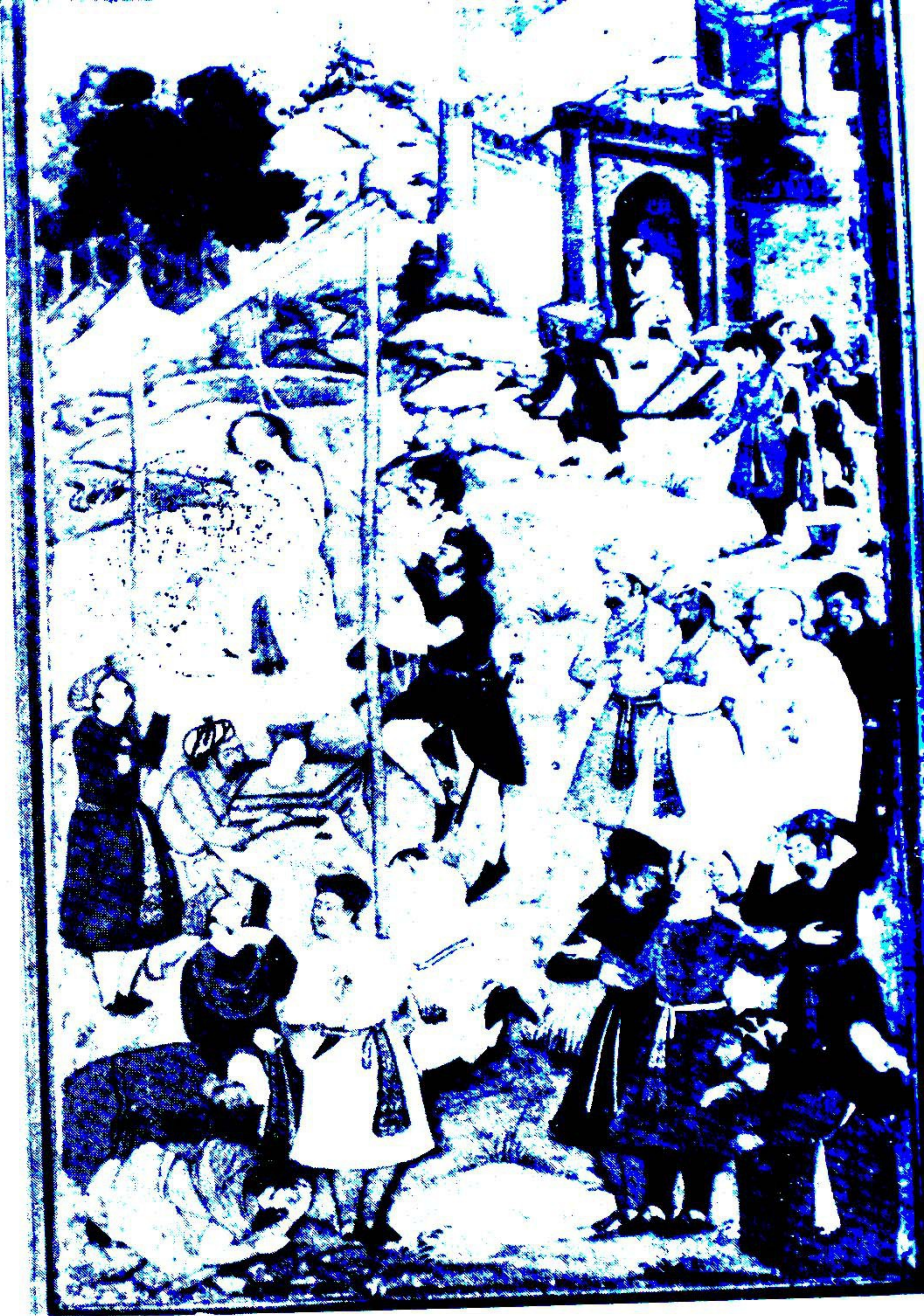
The martyrdom of Mansur al-Hallaj, from a manuscript of Amir Khusrau's Diwan , 17th Century India.