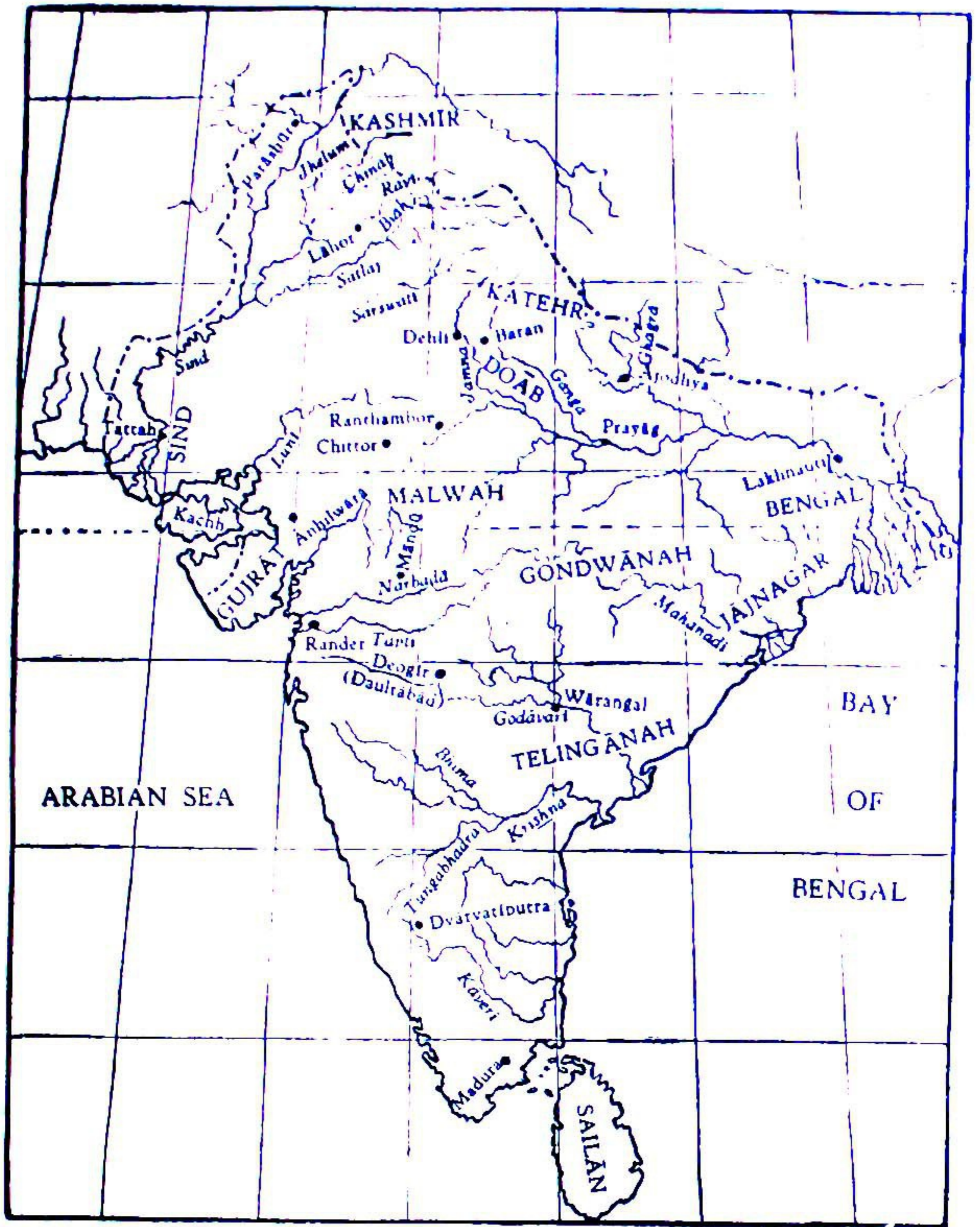
The Sultanate of Dehli in 1325