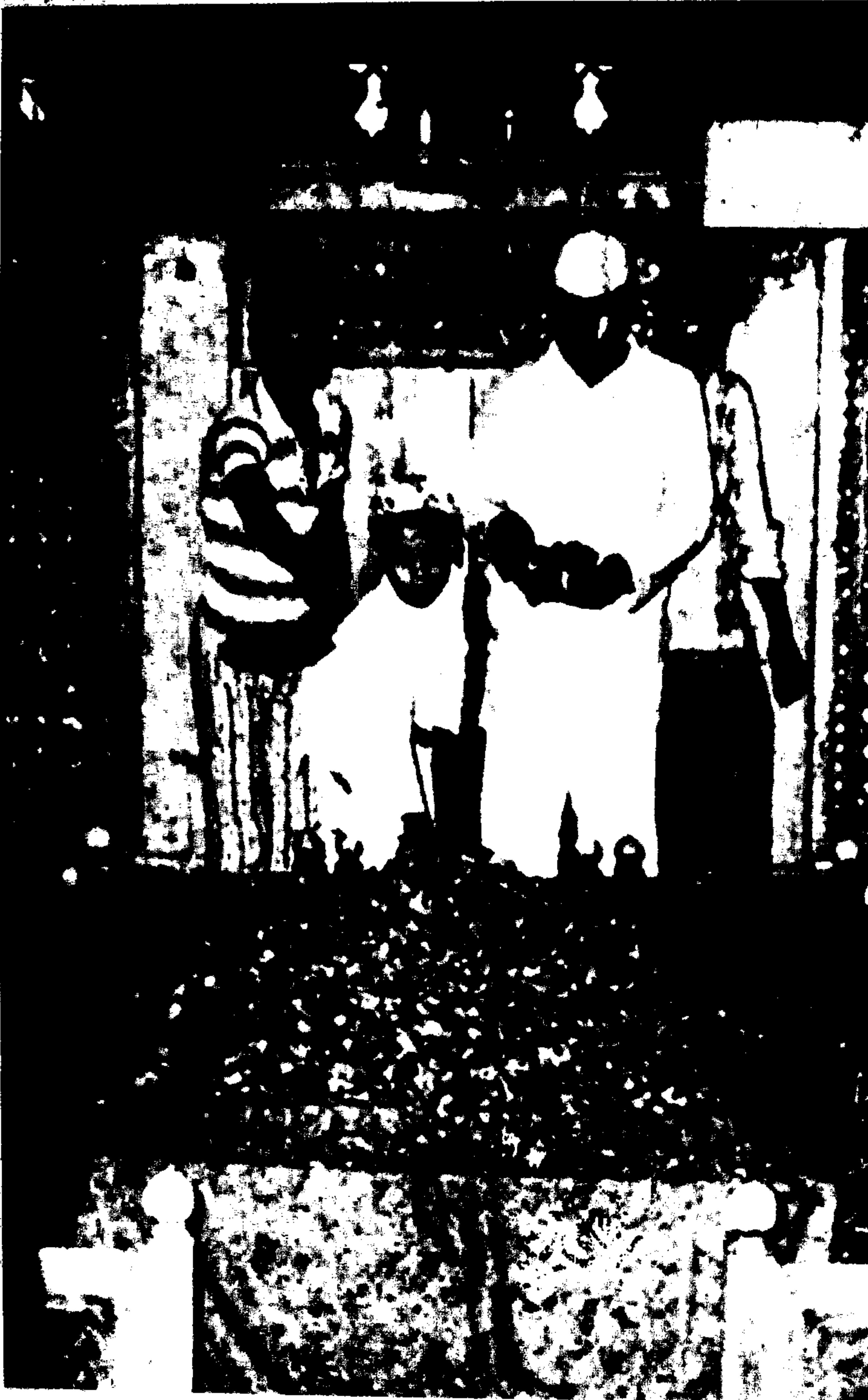
Mausoleum of Amir Khusrau Dehlavi