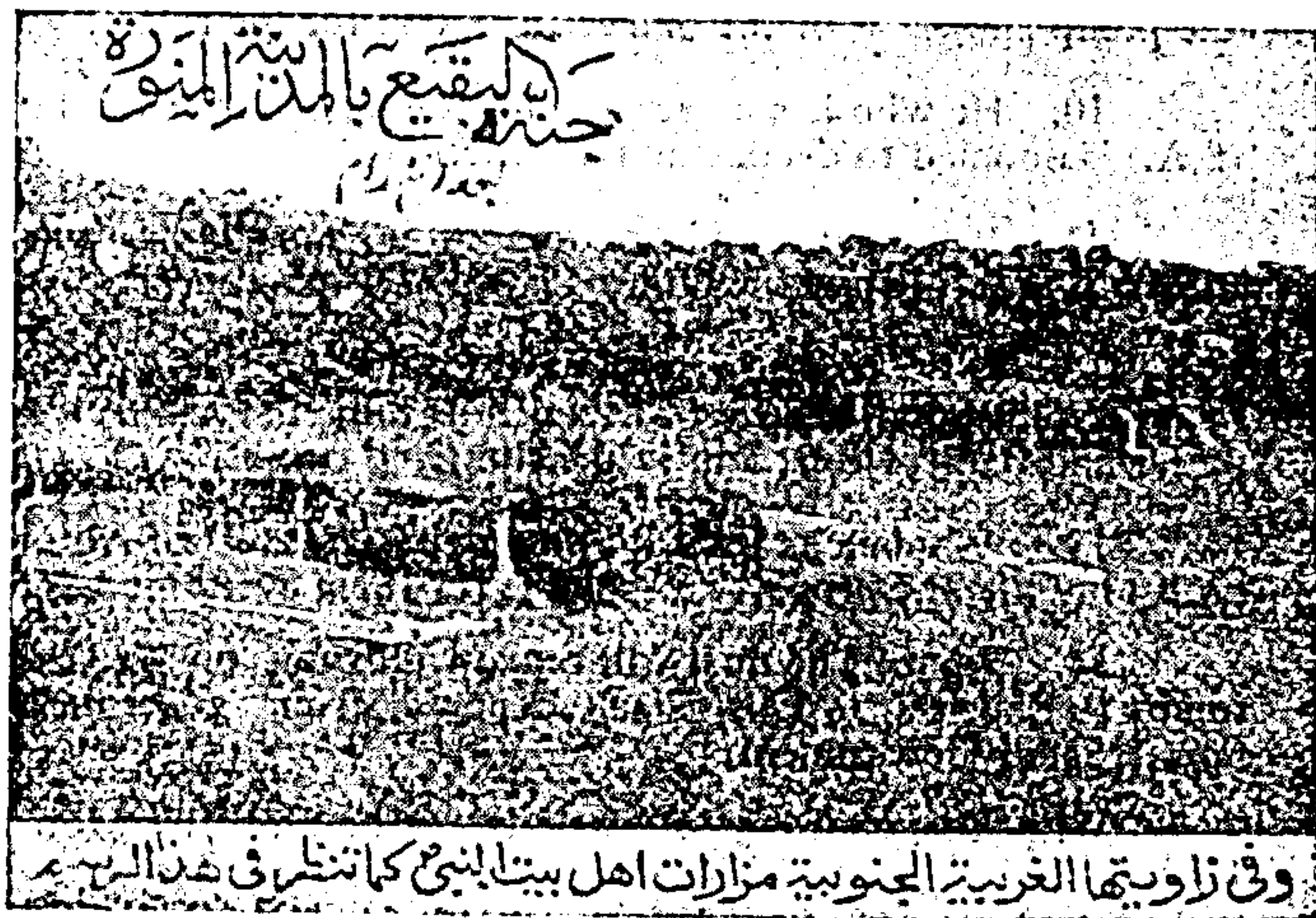
وفي زاويتها الغربية الجنوبية مزارات اهل بيت النبي كما تنتشر في هذا السهم