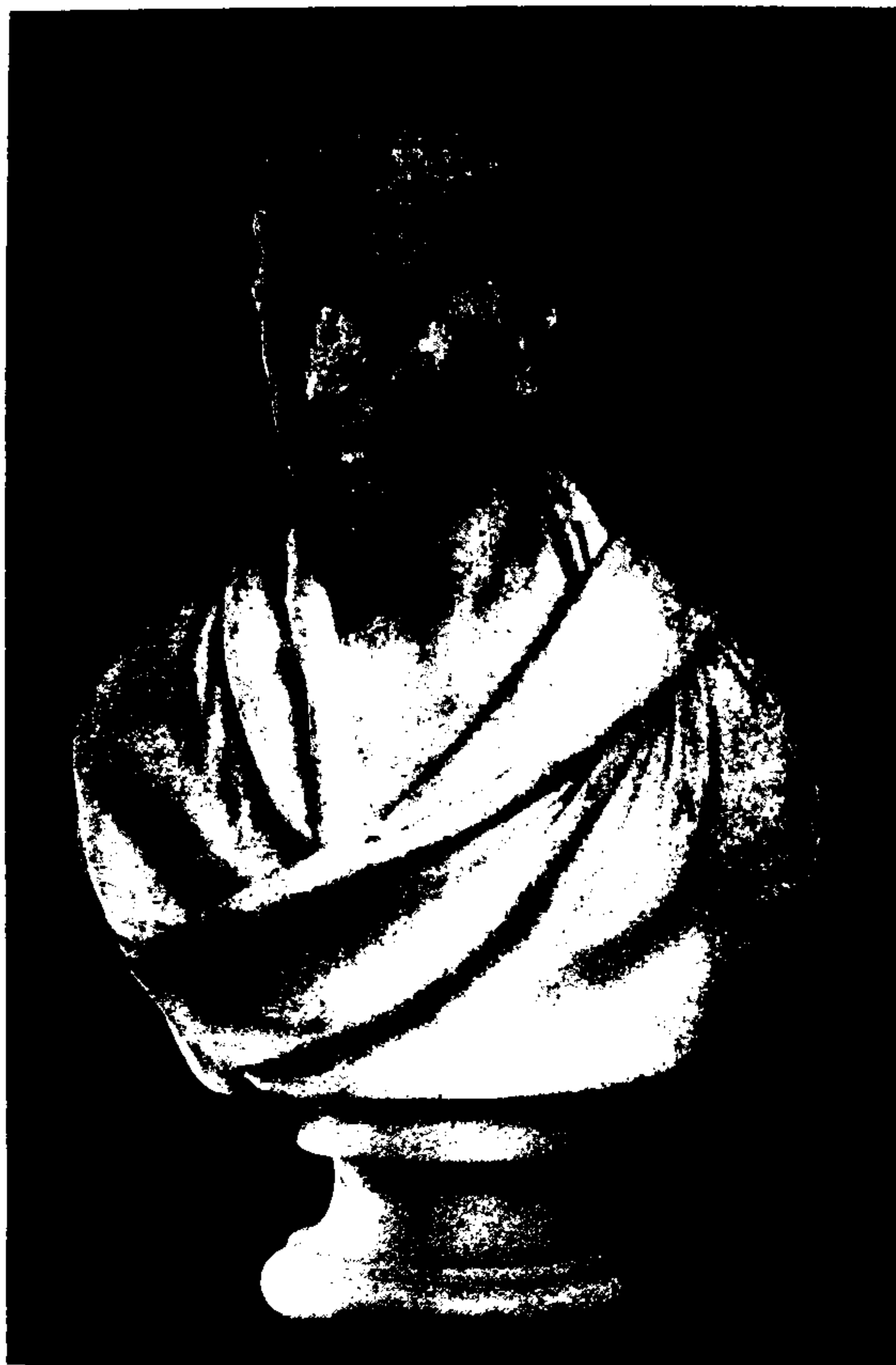
HENRY THOMAS COLEBROOKE (1765-1837). Bust by Chantrey.