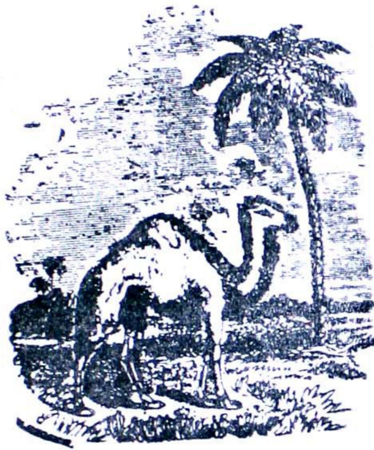
فاظر الي ابل كيف خلفت